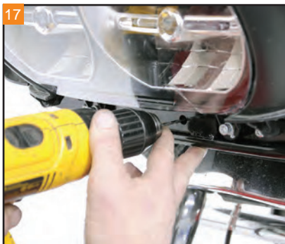
17 Drill two small pilot holes in the inner fairing support bracket.