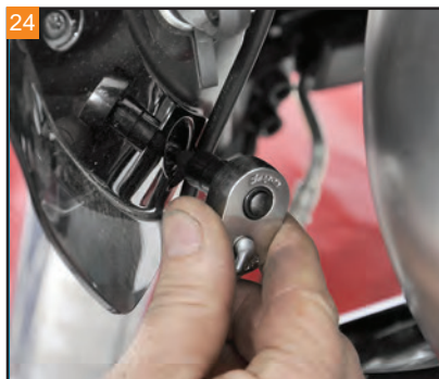
24 Use a T27 Torx to tighten the two bolts at the bottom of the inner fairing.