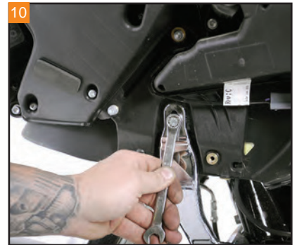
Use a 7/16" wrench to remove the bolt holding the stock fairing support brackets.