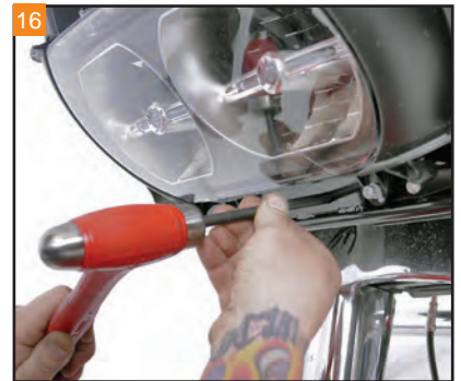
Use a center punch to mark the two holes to be drilled at the front of the inner fairing.