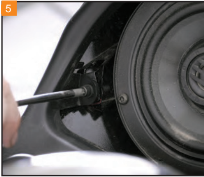
With a T30 Torx, remove the bolt on each side of the speakers.