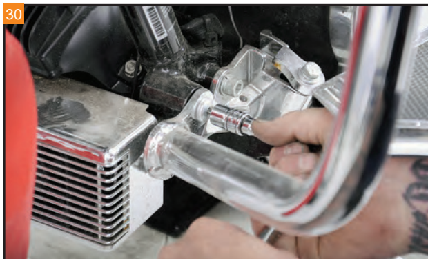
Use a T45 Torx to remove the two lower bolts holding the engine guard to the frame.