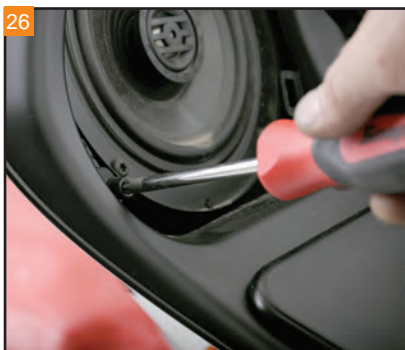
26 Tighten the bolt on each side of the speaker with a T30 Torx.