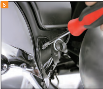
With a T27 Torx, remove the two remaining bolts holding the outer fairing.