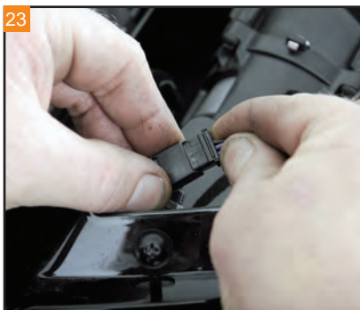
23 Plug in the front turn signal connectors.