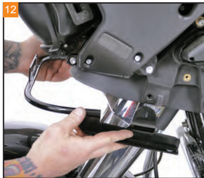
Bring the Bagger Nation Stealth Faring Support Bar into position at the front of the inner fairing.