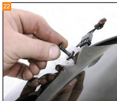
22 Use a windshield screw to hold the outer fairing while installing the remaining hardware.