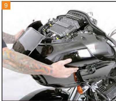
After removing the windshield screw, slide the outer fairing off the inner.