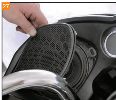
27 Install the speaker grills by snapping them into place.