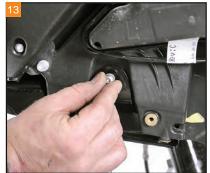
Hold the Stealth Faring Support Bar in place by loosely installing the stock bolt.