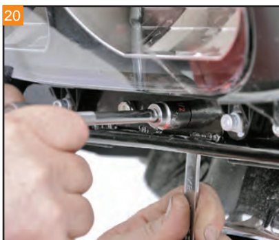
20 Use removable thread locker on the hardware. Tighten the hardware with a 1/2" wrench and socket.