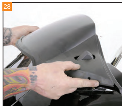
28 Bring the air vent assembly back into position.