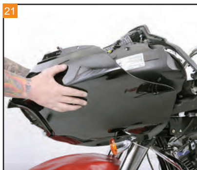
21 Slide the outer fairing back into position.