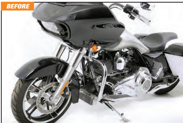
The 2015 FLTRX with stock engine guard and fairing supports.