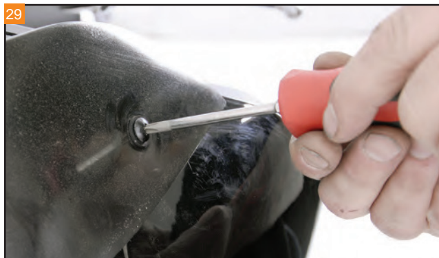
Reinstall the windshield with hardware.