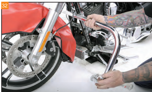
Slide the engine guard out from the side of the motorcycle.