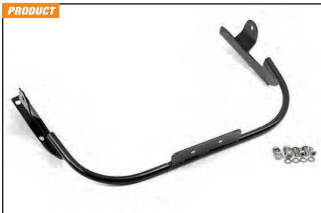
The Bagger Nation Stealth Fairing Support Bar with included hardware for 2015 and later Road Glide models.