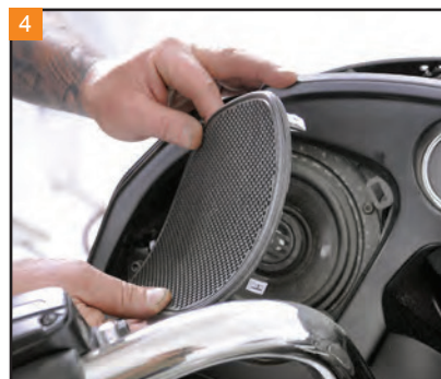
4 Carefully remove the speaker grills from the inner fairing.