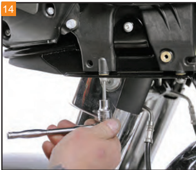
Tighten the lower bolt on each side with a 5/32" Allen. Go back and final tighten the upper stock bolt installed first.