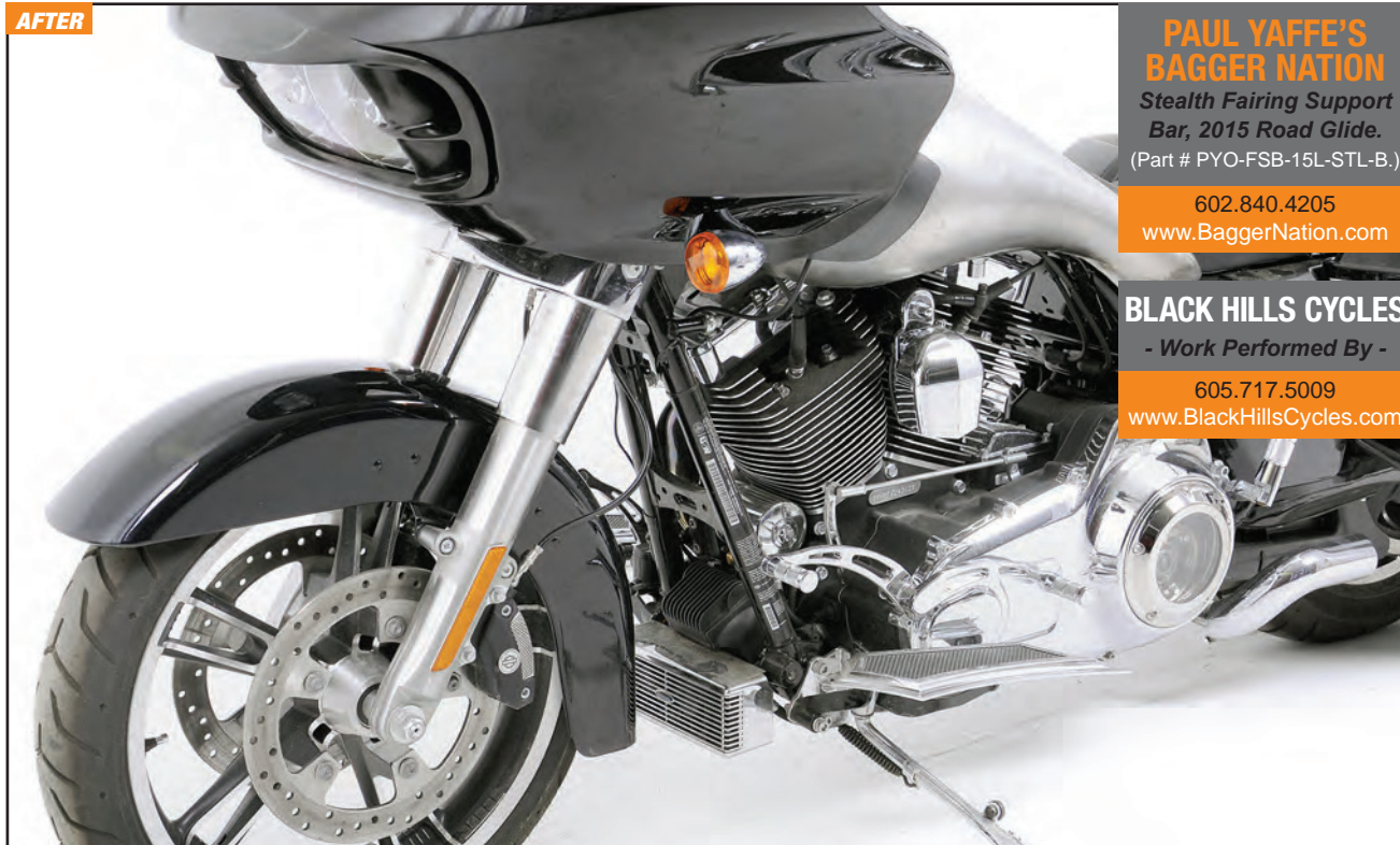
The 2015 Road Glide with Bagger Nation Stealth Faring Support Bar installed.