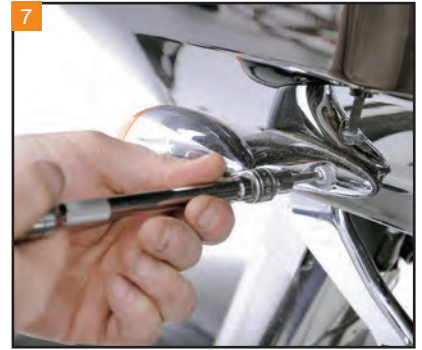
Use a 3/16" Allen wrench to remove the bolts behind the front turn signals.