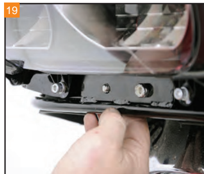
19 Install the supplied hardware through the inner fairing bracket and Stealth Fairing Support Bar.