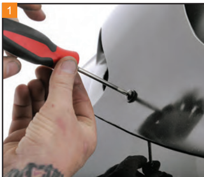
1 Use a Phillips screwdriver to remove the windshield hardware. Remove the windshield from the fairing.