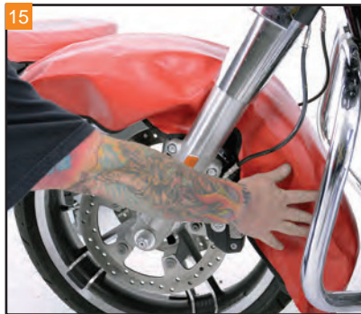
Place a fender cover over the front fender to protect the painted finish.