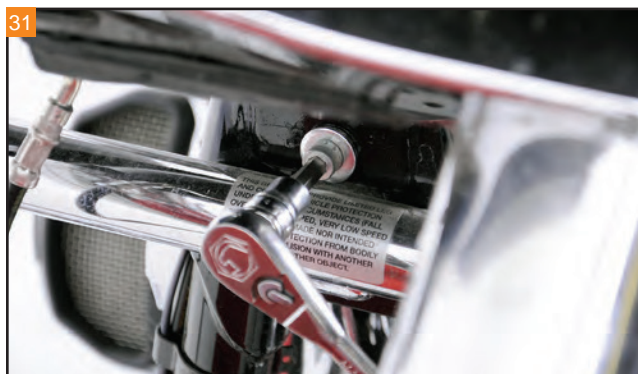
Remove the top engine guard bolt with a 1/4" Allen wrench.