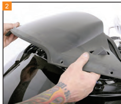
2 Lift the air vent assembly straight up and off the fairing.